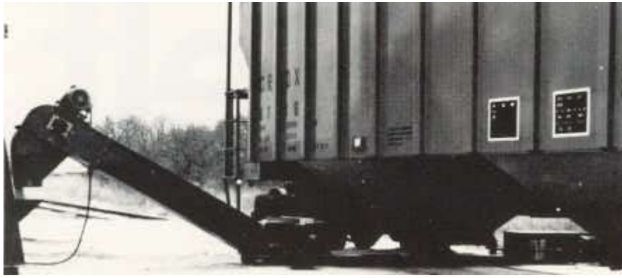
Model 1210 Cambelt Portable Railcar Unloader transferring material from railcar to bucket elevator inlet hopper.