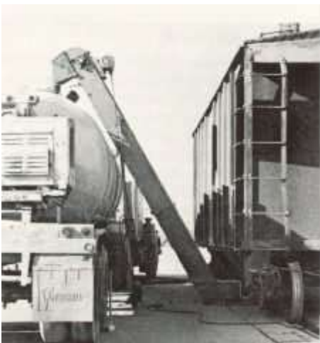
Low profile inlet positions between rail and discharge port. Swivel wheels and castors provide for lateral movement beneath car.