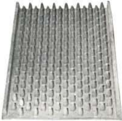
Exclusive nubbed CamBelt conveyor belt gives high incline capability. Model 1210 (shown) has one-inch-high-nubs and flanges.