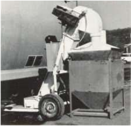
Model 1210 Portable Railcar Unloader unloading talc from railcar to be used in manufacture of roofing shingles. Replaces conventional bag handling operation.